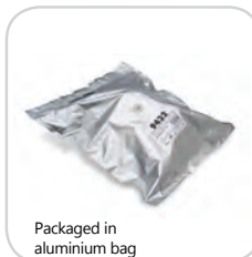
Packaged in aluminium bag