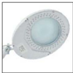
LED light 80HF 8w